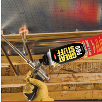
Gas line penetrations

Use GREAT STUFF PRO™ Gaps & Cracks Insulating Foam Sealant to seal and insulate around common areas of energy loss such as foundation/sill plate, outdoor fixtures, pipe penetrations, attic and more. 1