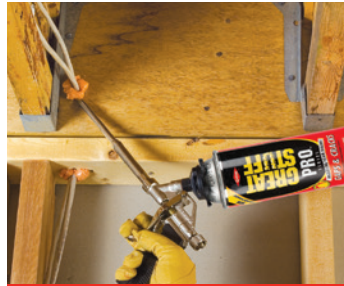
Electrical wire penetrations