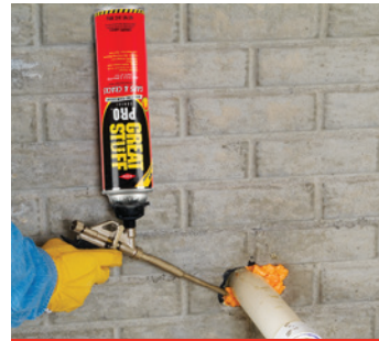
Plumbing and pipe penetrations